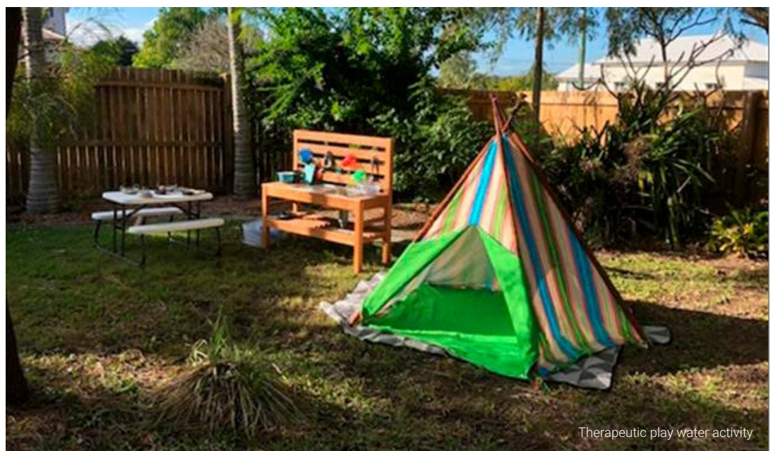
Therapeutic play water activity

All parties involved have learnt from the Newpin Qld SBB experience and will take those learnings into future service delivery, outcomes-based contracting and social impact investment initiatives.