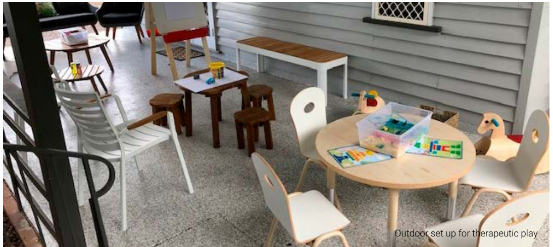
Outdoor set up for therapeutic play