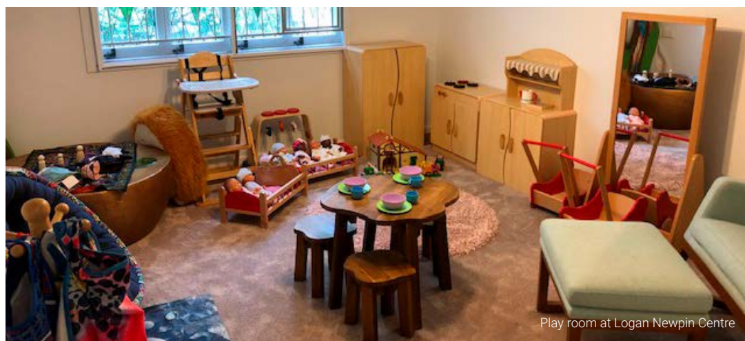
Play room at Logan Newpin Centre

The third Newpin Centre was scheduled to open in Ipswich in January 2020. However, at that point discussions about the future of the Newpin Qld SBB were ongoing and the parties agreed to defer the opening of the third centre.